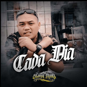
CADA DÍA by Sleepy Mano 2024