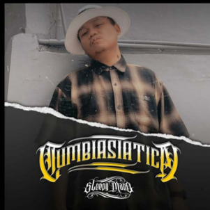
CUMBIASIATICA by Sleepy Mano 2024