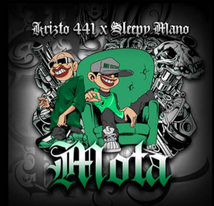
MOTA FT KRIZTO 441 by Sleepy Mano 2024