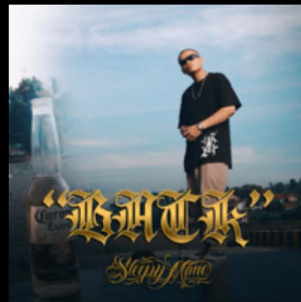
BACK by Sleepy Mano 2022